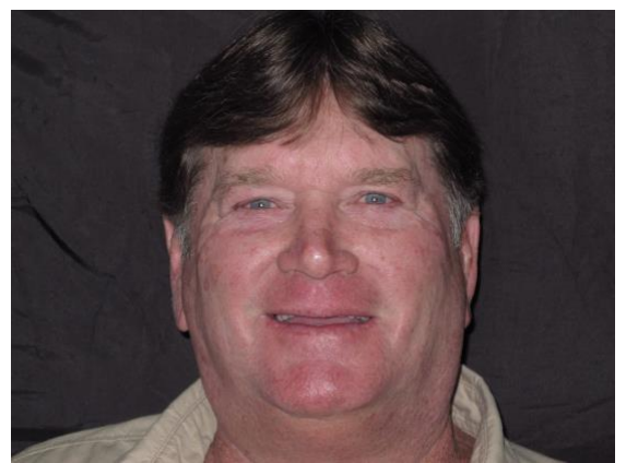
Patient with old denture

Notice the change in the appearance of the upper lip, now having no reverse smile. The front teeth are visible and look natural.